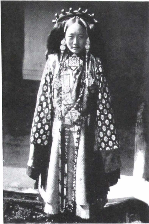
A LADY OF RANK FROM LHASA

She Is Dressed in Rich Brocade and Wears Many Jewels and a Head-Dress of Turquoises and Pearls and Coral