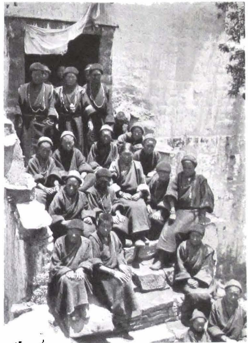
TIBETAN NUNS AT THEIR CONVENT-DOOR

We had a good deal of snow to plunge through that day. More snow fell at night, and our path was completely powdered over. On May 6, we had a clear morning for crossing the Jelap—a march that yearly exacts its toll of deaths amongst the dak-runners and muleteers. A particularly terrible story is told of how some coolies were found on the pass, leaning on their sticks, supporting their loads on their backs and grinning so broadly that they were hailed for their smiling welcome. But they were all frozen to death, and their lips stiffened in such a way as to show their teeth in this ghastly smile. Our coolies fell back much awed at my appearance in my flannel face-mask, which I had reserved for this occasion and which certainly gave me a forbidding look. We rode up the steep path between grand, snow-covered rocks, and, as we turned the last corner, we came upon great